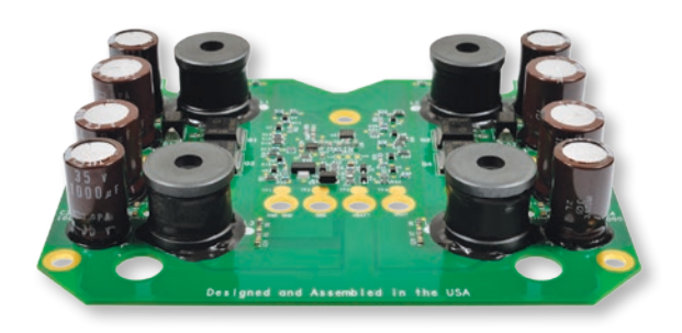
FCM203 Ford 6.0L Diesel Trucks (10-01) VIO Over 800,000

As you can see, our Fuel Injection Control Module Power Supply distributes heat more evenly, keeping diodes and other critical components cooler and preventing the failure that can occur in competitors' units.