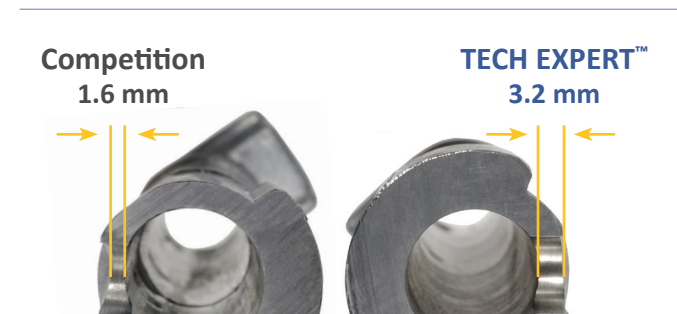
Cross-section shows TECH EXPERT™ is 2X thicker where it counts

Steering column shift tubes are used to move the automatic transmission's mechanical linkage when shifting at the steering column. Service technicians continue to see vehicles coming into their shops with broken steering column shift tubes. This labor intensive repair can exceed 2 hours.