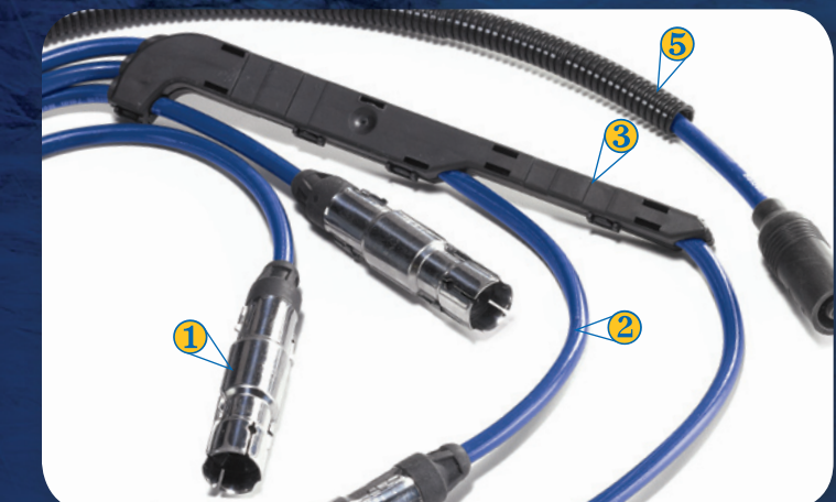
VOLKSWAGEN CABRIO, GOLF, JETTA, PASSAT 2.0L 2002 93