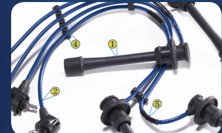
TOYOTA 4 RUNNER, T100, TACOMA 2.7L 97 94