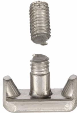
Broken OE Bolt

The battery cable bolts used on late model GM trucks have low torque specifications. As a result, they break easily during routine servicing. In the past, the broken bolt was commonly repaired in one of three ways: purchasing a new OE bolt from the dealer, installing a universal-style emergency terminal, or using a hose clamp. However, the dealership bolts can be expensive, the universal terminals are not a direct fit, and the hose clamp repair is temporary and unprofessional.