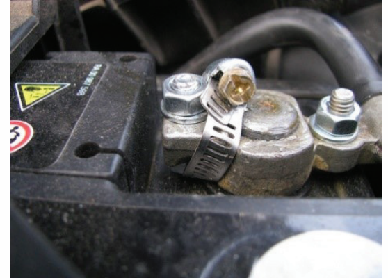
Temporary Hose Clamp Repair