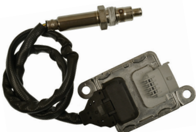
DNX3012 - SCR Catalyst Outlet Ram Trucks w/ 6 Cyl. 6.7L Engines (2017-14)

DNX3011 - Upstream Ram Trucks w/ 6 Cyl. 6.7L Engines (2018-13)