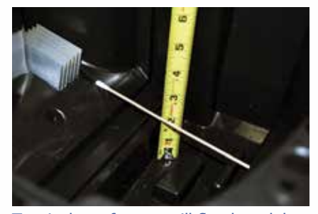
Two inches of water will flood module

On most full-size GM trucks and SUVs from 2001–2007, the blower motor resistor has two common failure modes: water damage and excess heat. The GM vehicles are unable to manage condensation. If the duct is clogged, condensation will collect, creating a pool of water that can seep into, and flood the blower motor resistor module. Worn OE blower motors can create a demand for current that also damages the module. The excess current melts the wiring and plastic shroud, damaging the interface pins on the controller's circuit board.