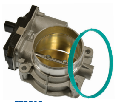
ETB565 GM Trucks and Vans, 4.3L (2018-14) VIO Over 460,000

ETB1405 GM Cars & Trucks (2020-14) VIO Over 1.2 million