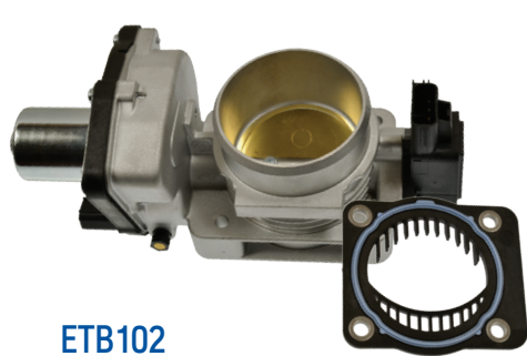
Ford/Lincoln (2019-10) VIO Over 2.1 million