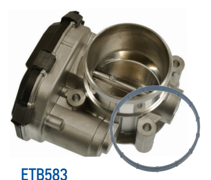
Ford/Lincoln Cars, Trucks, SUVs w/ a 2.7L Engine (2019-15) VIO Over 600,000