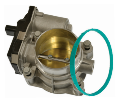
ETB564 GM Cars & SUVs, 2.4L (2017-12) VIO Over 2 million