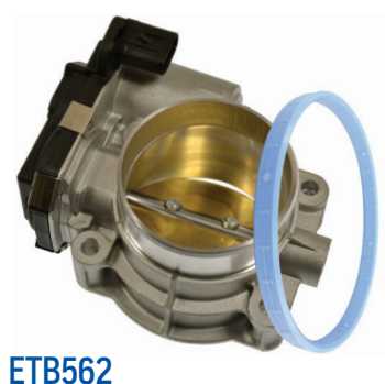
GM Cars & SUVs w/ a 3.6L Engine (2019-12) VIO Over 4 million

ETB759 Ram 2500, 3500, 4500, 5500 (2019-13) VIO Over 698,000