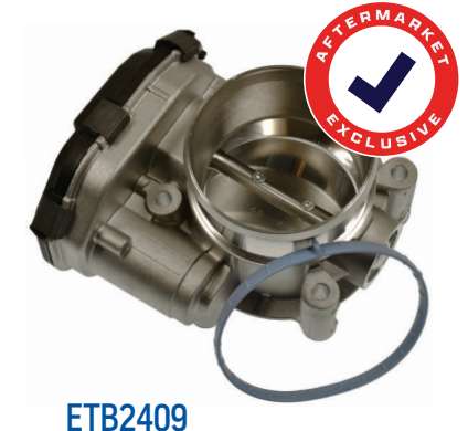
Ford/Lincoln Trucks & SUVs w/ a 3.5L Engine (2021-17) VIO Over 1.1 million

GM Trucks & SUVs, 5.3L (2019-14) VIO Over 3 million