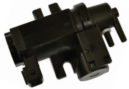
2-7004 BMW (2016-10) VIO Over 917,000