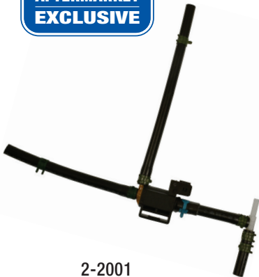
2-2001 Ford (2019-10) VIO Over 5.7 Million