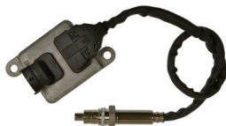
DNX3013 - Turbo Outlet Pipe

Ram Trucks w/ 6 Cyl. 6.7L Engines (2017-14)