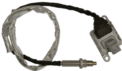
DNX3011 - Upstream

Ram Trucks w/ 6 Cyl. 6.7L Engines (2018-13)