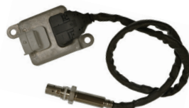
DNX3014 - Upstream