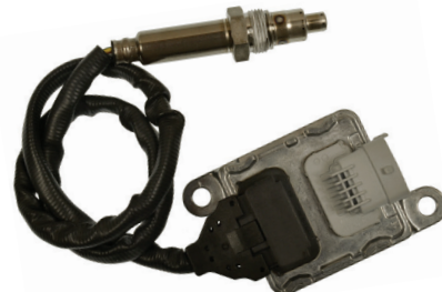
DNX3012 - SCR Catalyst Outlet

Ram Trucks w/ 6 Cyl. 6.7L Engines (2018-13)