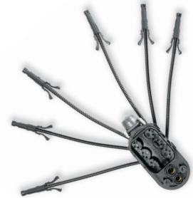
OE SCPI Injection System

GM's Vortec engines come with a Sequential Port Injection System (SCPI). NAPA® Echlin's Multi-Port Fuel Injection (MFI) system has several advantages over the original Sequential Central Port Injection (SCPI) system, including port fuel delivery and high reliability, better hot starts and reduced vapor emissions, and faster prime on hot restarts.