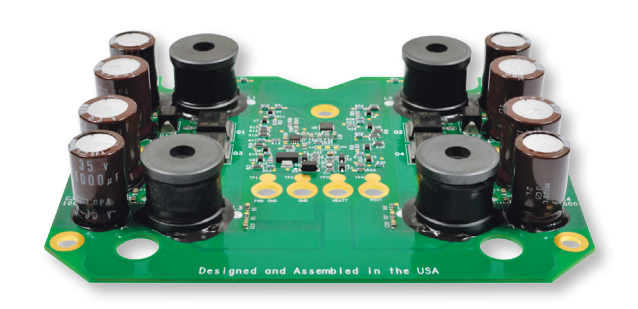
FCM203 Ford 6.0L Diesel Trucks (10-01) VIO Over 800,000

As you can see, our Fuel Injection Control Module Power Supply distributes heat more evenly, keeping diodes and other critical components cooler and preventing the failure that can occur in competitors' units.