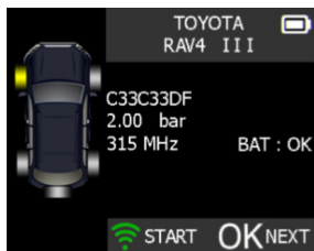
Use tool to read all sensor IDs