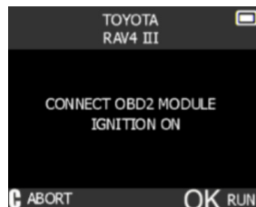
Turn on ignition