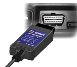
Connect tool to OBDII port