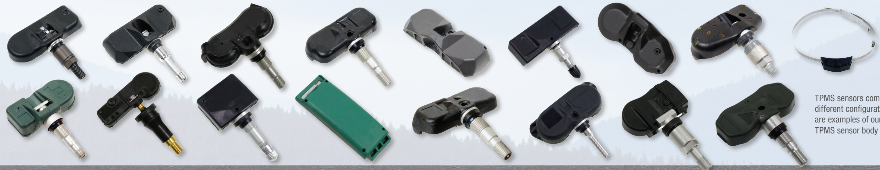
TPMS sensors come in many different configurations. Here are examples of our typical TPMS sensor body styles.