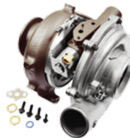
TRB225R Ford F Pickups, E-Vans (2007-05)