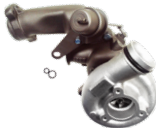
TRB103R GM Pickups, Fullsize Vans, P Series Vans (2002-96)