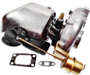
TRB100R GM Pickups (2002-95)

Why Turbo? Turbochargers help increase available oxygen content inside the engine. This additional oxygen is needed to achieve or maintain acceleration in diesel engines at higher RPMs. Providing you with premium replacements, we've performed extensive research to determine the numbers you'll need to compete in this rapidly growing market.