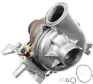
TRB217R Ford E-Vans (2003-99)