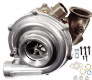
TRB223R Ford F Pickups, E-Vans (2005-04)