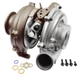
TRB220R Ford F Pickups, E-Vans, Excursion (2004-03)