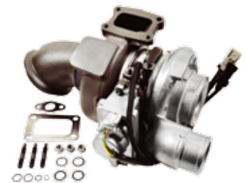
TRB338R Dodge Pickups (2010-07) Ram Trucks (2012-11)