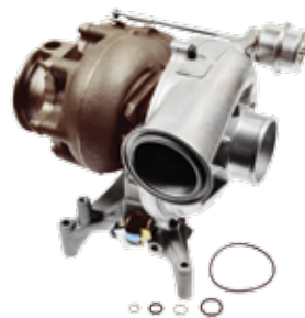
TRB215R Ford F Pickups, E-Vans, Excursion (2003-99)