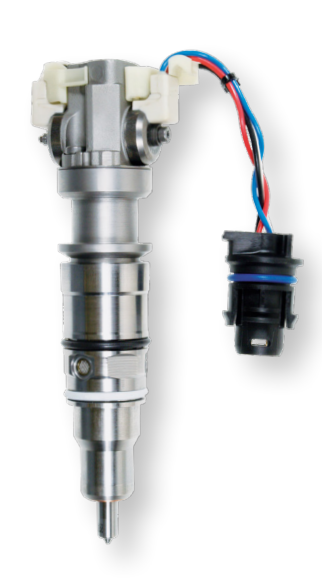
INJ220R Ford F Pickup (2004-03) International Trucks (2003-02)