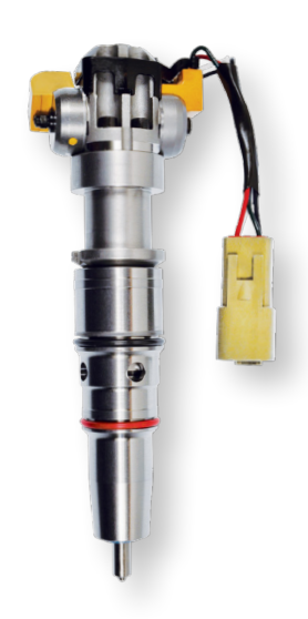
INJ421R International Trucks (2005-04)