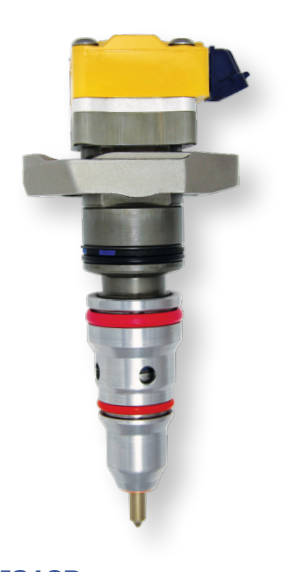
INJ218R Ford F Pickup, E-Vans (2003-99) International Trucks (2002-99)