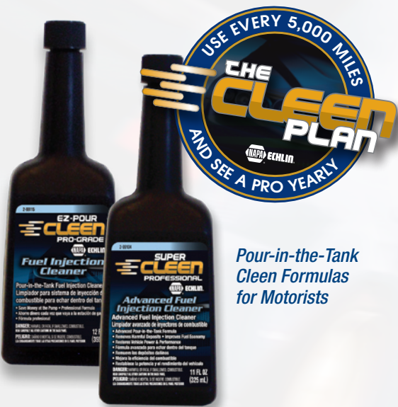
Pour-in-the-Tank Clean Formulas for Motorists

The Clean Plan is a comprehensive fuel injection cleaning program that combines motorist preventative maintenance with a regular professional cleaning.