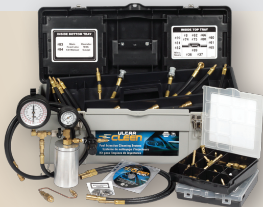
2-18495Q uses Ultra Clean fuel system cleaner (2-18469)