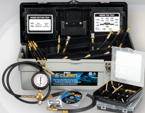
2-18496Q uses Pro Clean aerosol (2-18489)