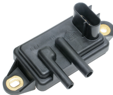
DPFE Sensor 2-19200