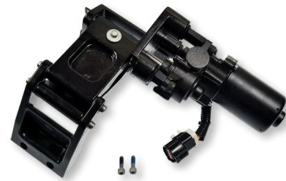
PRB100 Ford Expedition (2014-07) Lincoln Navigator (2014-07) VIO Over 500,000

With coverage for key Ford and Lincoln applications, Tech Expert's brand-new OE-Exact-Match Power Running Board Motors are complete-assembly solutions, so you can finish the job in one go, whether the failure is along the hinges or the motor.