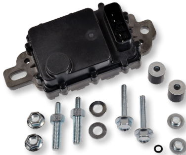
FPM100 Ford Sedans and Trucks (2011-04) VIO Over 6 Million

Tech Expert's new Fuel Pump Driver Module features several OE upgrades: a robust O-ring and 10-point mechanical screw assembly that eliminate glue breakdown and an anodized bottom housing that improves resistance to electrolysis-related corrosion.