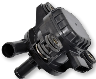
HCP502 Toyota and Lexus Hybrids (2015-12) VIO Over 850,000

Tech Expert is excited to announce our new OE-Exact-Match Inverter Coolant Pump. This is a high-failure part on Toyota and Lexus hybrid applications that is designed to keep key components at optimal operating temperatures.