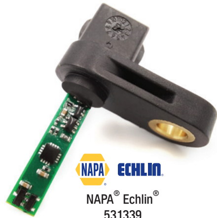
NAPA ECHLIN NAPA® Echlin® 531339

Aftermarket competitors' ABS sensors are not able to measure the direction of the vehicle