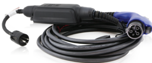
NAPA® Echlin® EBC303 Battery Charging Cable Toyota RAV4 (EV), Prius (2022-10)