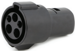
NAPA® Echlin® EBC300 Charging Cable Adapter Tesla 3, S, X, Y, & Roadster (2023-08)