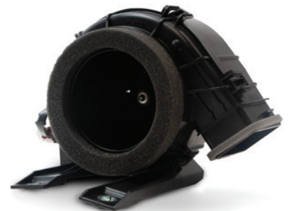
NAPA® Temp 412783 Battery Cooling Fan Motor Toyota Prius (2019-16)