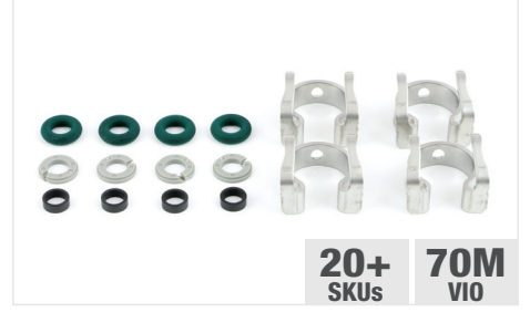
GDI Injector Seal and Service Kits

Optimal fuel injection performance takes quality components, expert manufacturing and extensive testing. And that's precisely what NAPA Echlin® delivers.