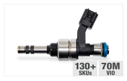
GDI Fuel Injectors