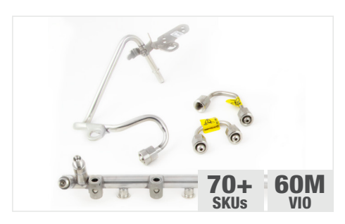
GDI High- & Low-Pressure Fuel Feed Lines