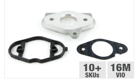
GDI O-rings, Gaskets, and Plates