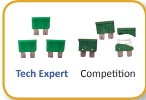
Tech Expert Competition

Flexible cantilever-spring contacts ensure positive connection after multiple fuse replacements