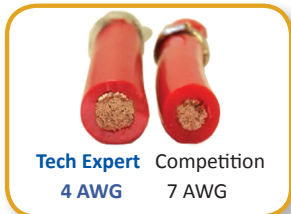
Tech Expert Competition 4 AWG 7 AWG

Zinc-plated copper conductors and terminals have 72% more conductivity than the brass counterparts