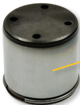
New Tech Expert™ CMF700

VW/Audi 2.0T 2013-06 VIO over 1.0 Million