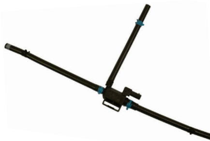
2-2003 Ford (2019-13) VIO Over 1 Million