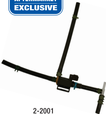
2-2001 Ford (2019-10) VIO Over 5.7 Million