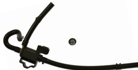
2-11005 GM (2020-11) VIO Over 2 Million