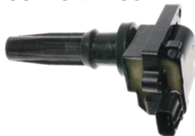
Hyundai / Kia