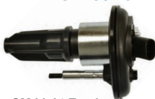
GM Light Trucks