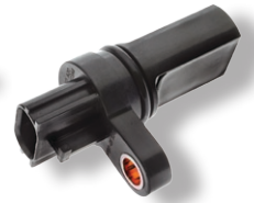
Nissan Camshaft Sensor CSS1004

NAPA Echlin LOOKS RIGHT. FITS RIGHT. PERFORMS RIGHT.