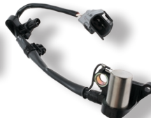
Toyota Crankshaft Sensor CSS9041