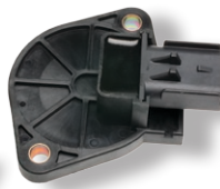
Chrysler Camshaft Sensor CSS1100