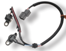
Honda Crankshaft Sensor CSS9025