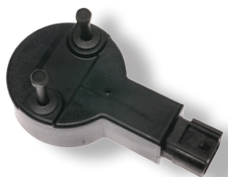
Ford Camshaft Sensor CSS522