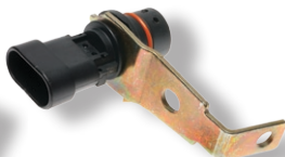
GM Crankshaft Sensor CSS212