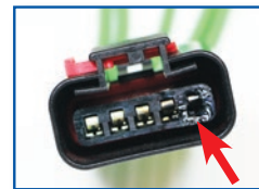
Burnt OE connector

Due to technological advancements on today's automotive heating and cooling systems, blower motor resistors have high amounts of current running through their connectors. As a result, the current produces heat that can melt the connector and resistor. Worn OE blower motors can create a demand for current that also damages the resistor or module. The excess current melts the wiring and plastic shroud, damaging the interface pins on the controller's circuit board.