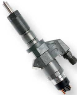
INJ135R GM Pickups (2004-01)