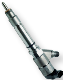
INJ140R GM Pickups, Fullsize Vans (2007-06)