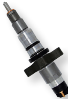
INJ335R Dodge Pickups (2009-04)