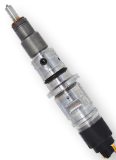
INJ338R Dodge Pickups (2010-08)