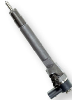
INJ330R Dodge Sprinters (2006-04)