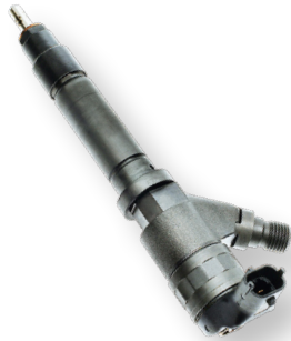
INJ136R GM Pickups (2005-04)

Here are some of our top selling Remanufactured Diesel Fuel Injectors for Common Rail Injection (CRI) systems: