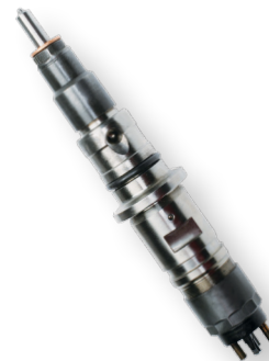
INJ332R Dodge Pickups (2010-07)