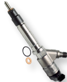
INJ145R GM Pickups, Fullsize Vans (2010-07)