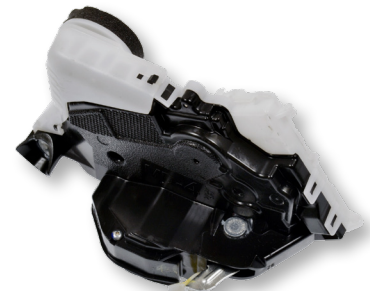
DLA1301 Toyota Tacoma (2015-05) VIO Over 1.4 Million