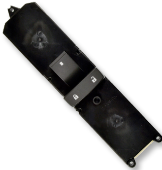
PA4502 GM Full Size Trucks & SUVs (2014-07) VIO Over 4.8 Million