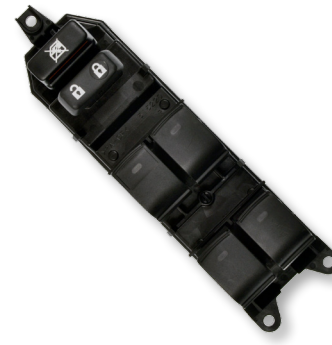
PA4505 Toyota Camry (2011-09) Toyota Land Cruiser (2013-08) Toyota Prius (2015-10) Toyota Venza (2012-09) Lexus CT200h (2013-11) VIO Over 2.3 Million