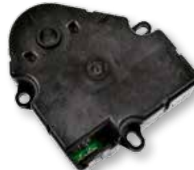
ADA225 Jeep Cherokee (2001-98) Jeep TJ (2006-01) Jeep Wrangler (2006-01) VIO Over 700,000