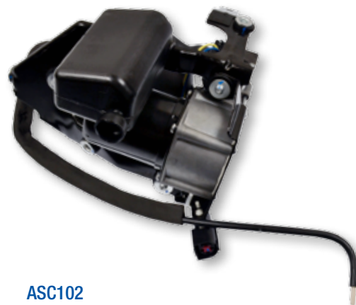
ASC102 Ford Expedition (2006-02) Lincoln Navigator (2006-02) VIO Over 700,000