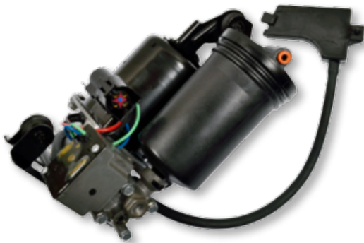
ASC103 Ford Crown Victoria (2011-03) Lincoln Town Car (2011-03) Mercury Grand Marquis (2011-03) VIO Over 850,000

Tech Expert is happy to introduce Air Suspension Compressors for Ford and Lincoln applications. These compressors are responsible for the delivery of air needed in today's electric driven suspension systems to raise or lower the vehicle's height depending on road conditions. These compressors are known to burn out and fail, affecting your vehicle's on-road performance. Tech Expert has you covered with brand new direct-fit OE-matching compressors, to ensure the job is done right the first time.