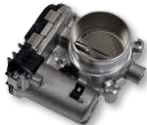
ETB169 Ford Edge & Focus (2014-12) Ford Explorer (2015-12) Ford Fusion & Taurus (2015-13) Lincoln MKT & MKZ (2016-13) VIO Over 1.2 Million