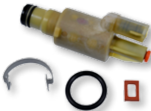
APS104 Ford Crown Victoria (2011-92) Lincoln Town Car (2007-91) Mercury Grand Marquis (2011-92) VIO Over 1.8 Million