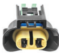
EC3006 Fog Lamp Socket (2022-2017)