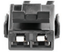
EC3010 Power Seat Lumbar Motor Connector (2023-2000)