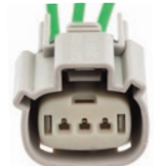
EC3093 Daytime Running Lamp, Ignition Coil, Intake Manifold Runner Control Sensor, Water In Fuel Sensor Connector (2022-2010)

For more specific application data, visit NAPAEchlin.com