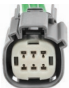
EC3086 Nitrogen Oxide Sensor Module, Taillight Connector (2022-2013)