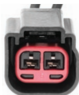
EC3073 Engine Coolant Fan Motor, Power Window Motor Connector (2014-1999)