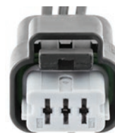
EC3084 Turbocharger Wastegate Actuator Connector (2018-2015)