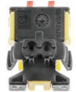
EC3062 Air Bag, Seat Belt Pretensioner Connector (2023-2009)