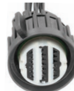
EC3092 Transmission Bulkhead Connector (2019-2011)