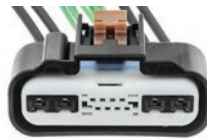
EC3020 Windshield Wiper Motor Connector (2023-2002)