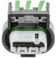
EC2707 Cam/Crankshaft Sensor, EGR Pressure Feedback Sensor Connector (2021-2018)