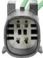
EC3003 Oxygen Sensor Connector (2020-2011)