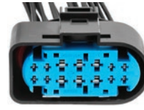
EC3008 Headlight Wiring Harness Connector (2019-2012)