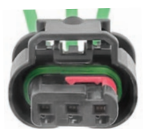
EC3085 Water Pump, License Plate Light, Park Assist Sensor Connector (2023-2013)