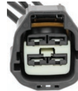
EC3026 Cooling Fan Motor Connector (2022-2010)