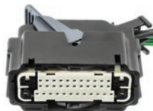
EC3071 ABS Control Module Connector (2019-2011)