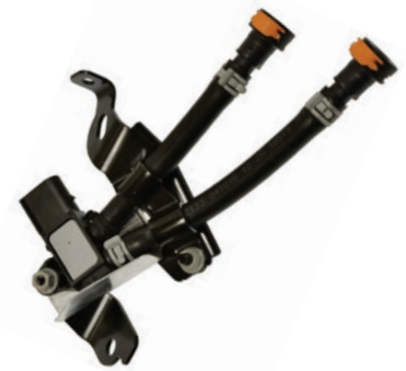
DEF Temperature Sensors