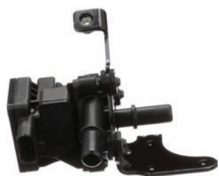
Vapor Canister Purge Pumps

The evaporative emission control system (EVAP) delivers fresh air and unburned vaporized hydrocarbons to the intake system to be reburned in the engine. NAPA® Echlin® offers a wide range of EVAP components to keep this complex system operating as designed.