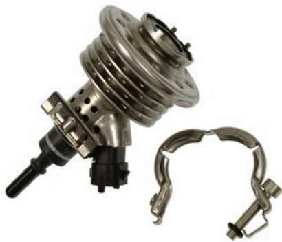
DEF Injection Nozzles

Diesel vehicles feature complex emission systems. NAPA® Echlin® has them covered, with parts that are tested and proven to perform.