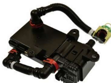
Fuel Vapor Leak Detection Pumps