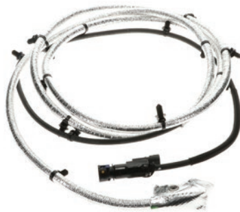
DEF Injector Feed Lines