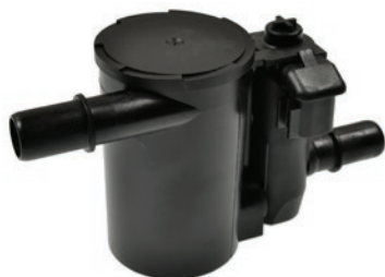
Canister Vent Solenoids