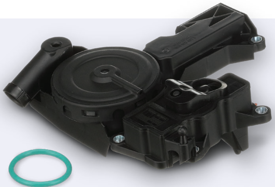
Engine Oil Separator

Engine Oil Separators keep oil from recirculating into the cylinders, coating the intake with oil and blocking airflow. This can lead to reduced engine performance and reliability.