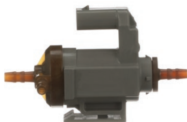
Canister Purge Valves