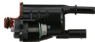
Canister Vent Valves