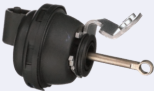
EGR Control Solenoids