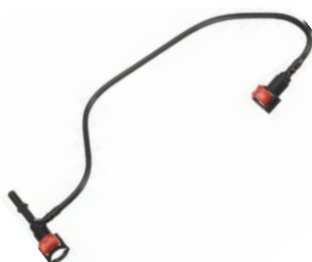
Vapor Canister Vent Hoses