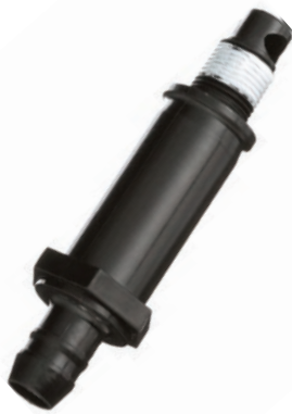
Crankcase Ventilation Filters

Positive crankcase ventilation systems route blow-by gases from the crankcase through the PCV valve and intake manifold, into the combustion chamber. Each crankcase emission component is designed as a direct-fit OE replacement, ensuring that it is easy to install and performs as intended.