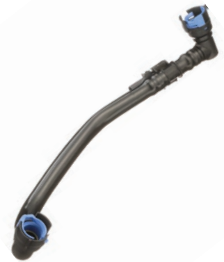
Crankcase Breather Hoses