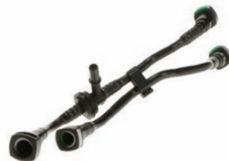
Vapor Canister Purge Valve Hoses