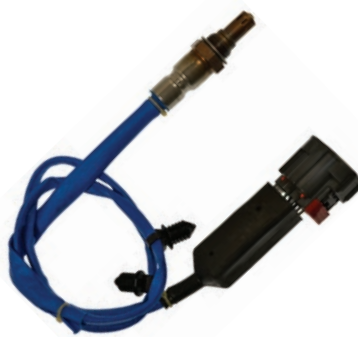
Nitrogen Oxide Sensors