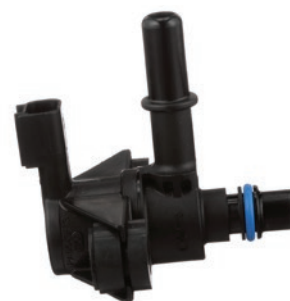
Canister Purge Solenoids