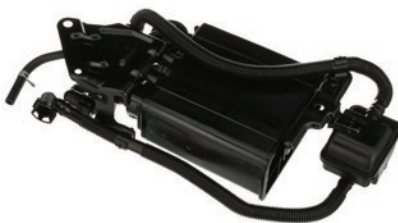
Fuel Vapor Canisters