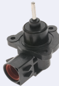
EGR Valve Vacuum Modulators